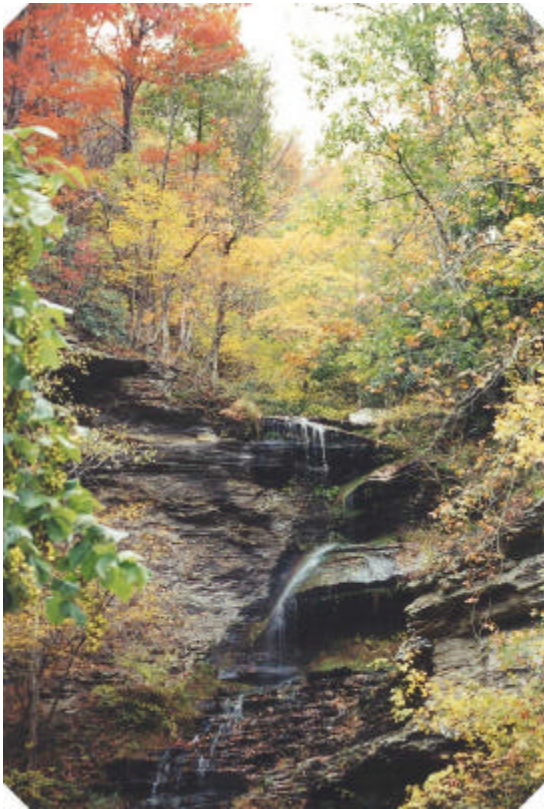
Hawks Nest State Park, Photo by: Rex A. Hill