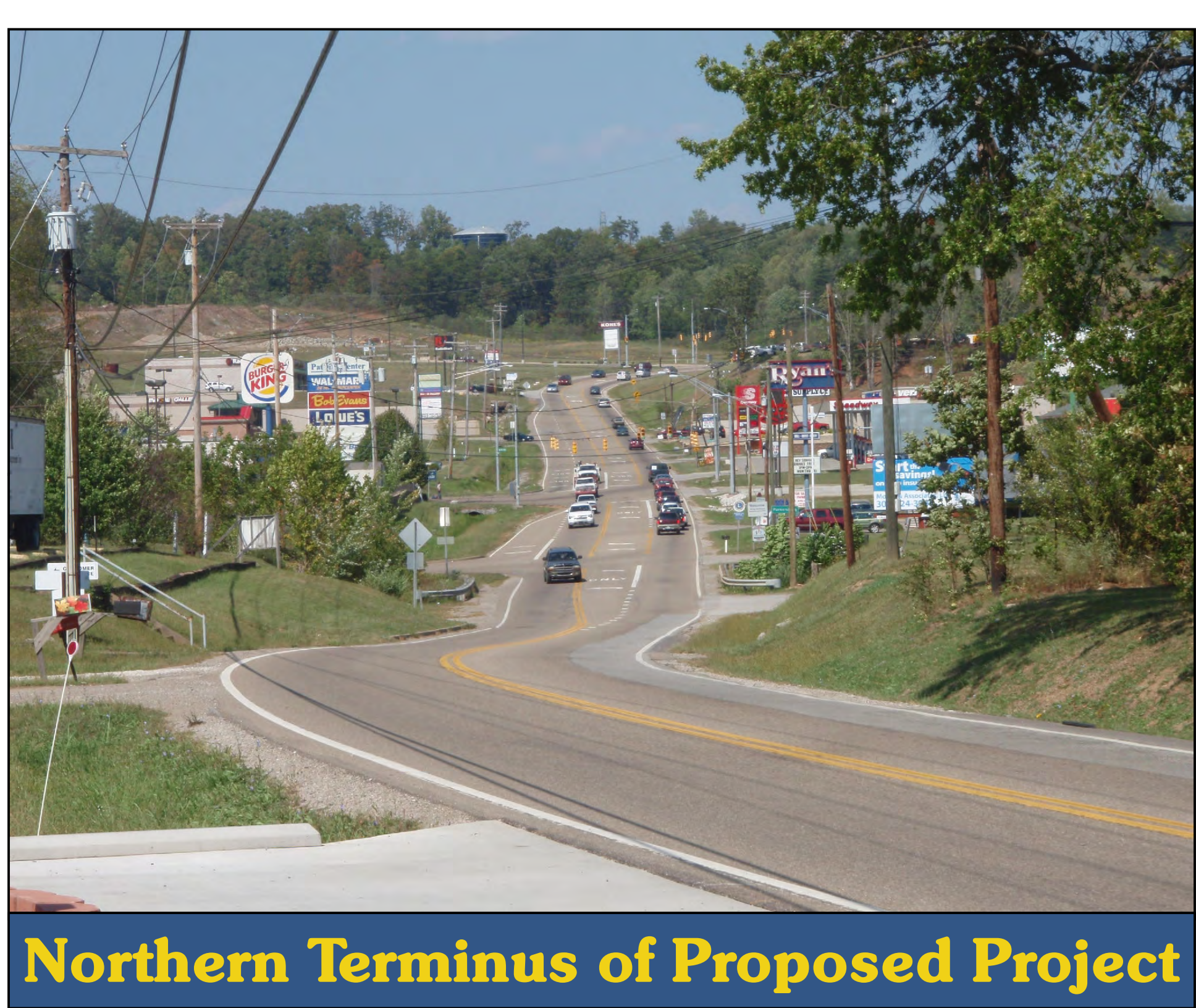
Pettyville commercial district includes several large chain stores such as Walmart Supercenter.